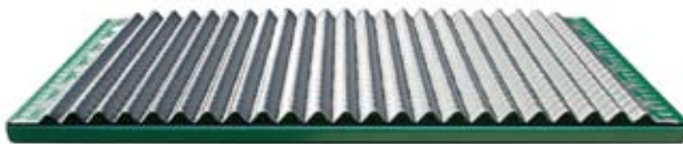
PMD 46x23 Screen

Derrick now makes replacement screens to fit non-Derrick shale shakers. Continuing with its commitment to remain the leading technology provider of fine screens, Derrick's Research and Development department has developed a pretensioned screen for the Mongoose shale shaker. Utilizing Derrick's PMD™ and PWP™ technology, the PMD 46x23 and PTM 46x23 replacement screens are API RP 13C (ISO 13501) compliant to ensure accurate cut point designation.